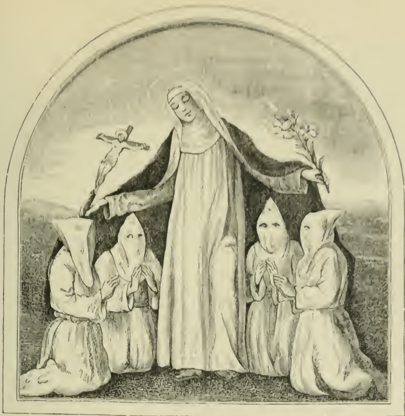
ST. CATHERINE, AND THE COMPANY OF THE B. VIRGIN