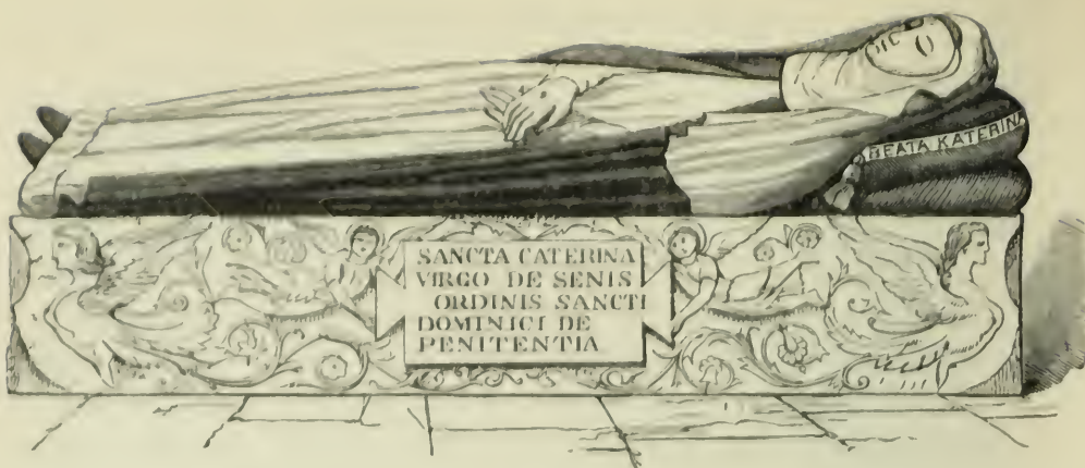
TOMB OF ST. CATHERINE