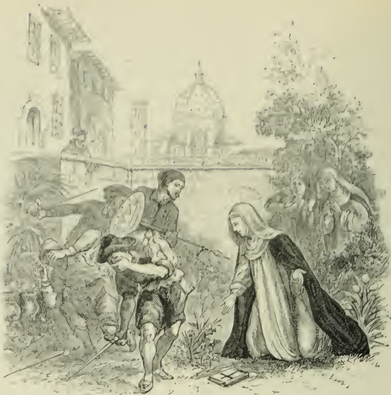
ST. CATHERINE IN THE GARDEN