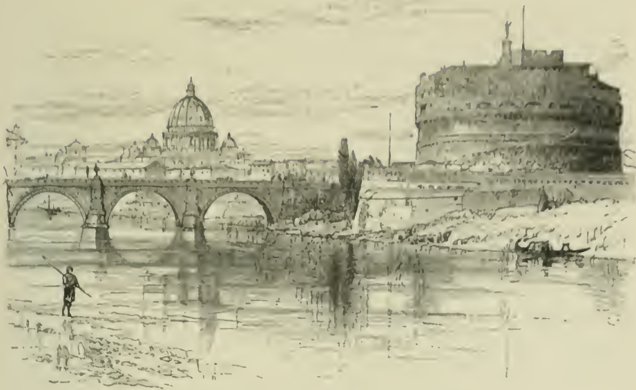
THE CASTLE OF ST. ANGELO, ROME